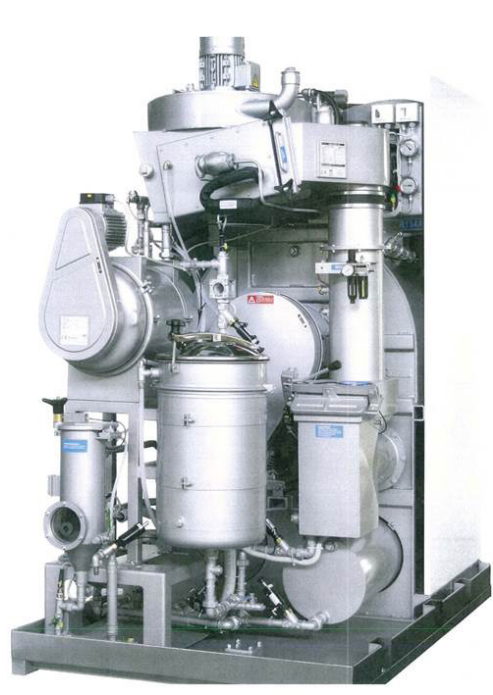
SLIM-BODY GREENEARTH OPTIMIZED MACHINE