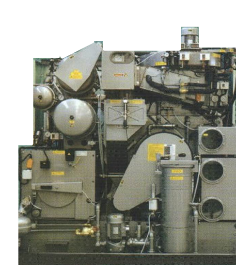
STANDARD CLASS IIIA MACHINE